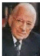
Herbert W Armstrong 1892 - 1986

To fully understand the significance of these prophecies, you need to know where the United States and Britain are mentioned in prophecy. This question is answered in the booklet "The United States and the British Commonwealth in Prophecy."